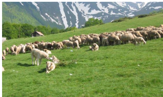
Left to right: Bosnian lily; traditional livestock farming.